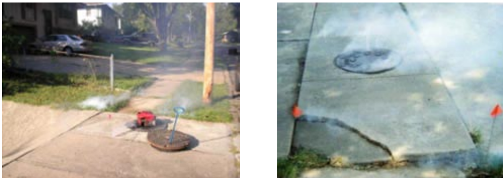
High-capacity blowers are used to pump smoke into a manhole (left photo). In the right photo, smoke is pushed into the system and emerges from cracks in the sidewalk and at a downstream manhole.